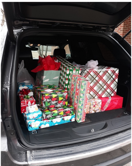
The ECW coordinated the annual Adopt a Military Family for Christmas, as usual St. Luke's gave generously!