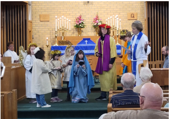
We were happy to have a pageant in December!

Are you interested in attending shows, cultural events, etc. around the city? The vestry is looking to plan some outings, if you have ideas/would like to help please talk to a vestry members!