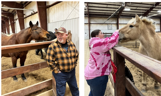
Our Winter Sleigh Ride was switched to a wagon ride due to lack of snow but we still had a lot of fun on a crisp and bright January day!