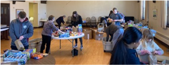
St Luke's had great help packing sack lunches for the local shelter from the Drake/Grandview ROTC cadets and InterVarsity on Sunday, February 18. Thanks to all!!

Thank you, St. Luke's, for keeping the Pantry supplied with bags.